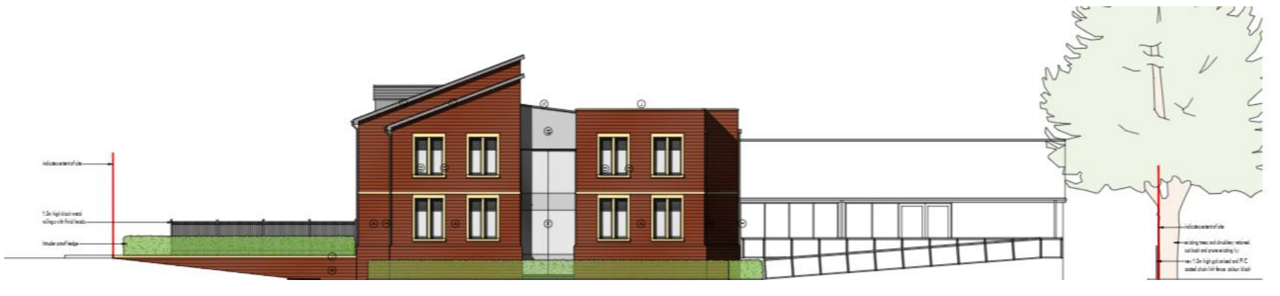
Side elevation close to 78 Worcester Road